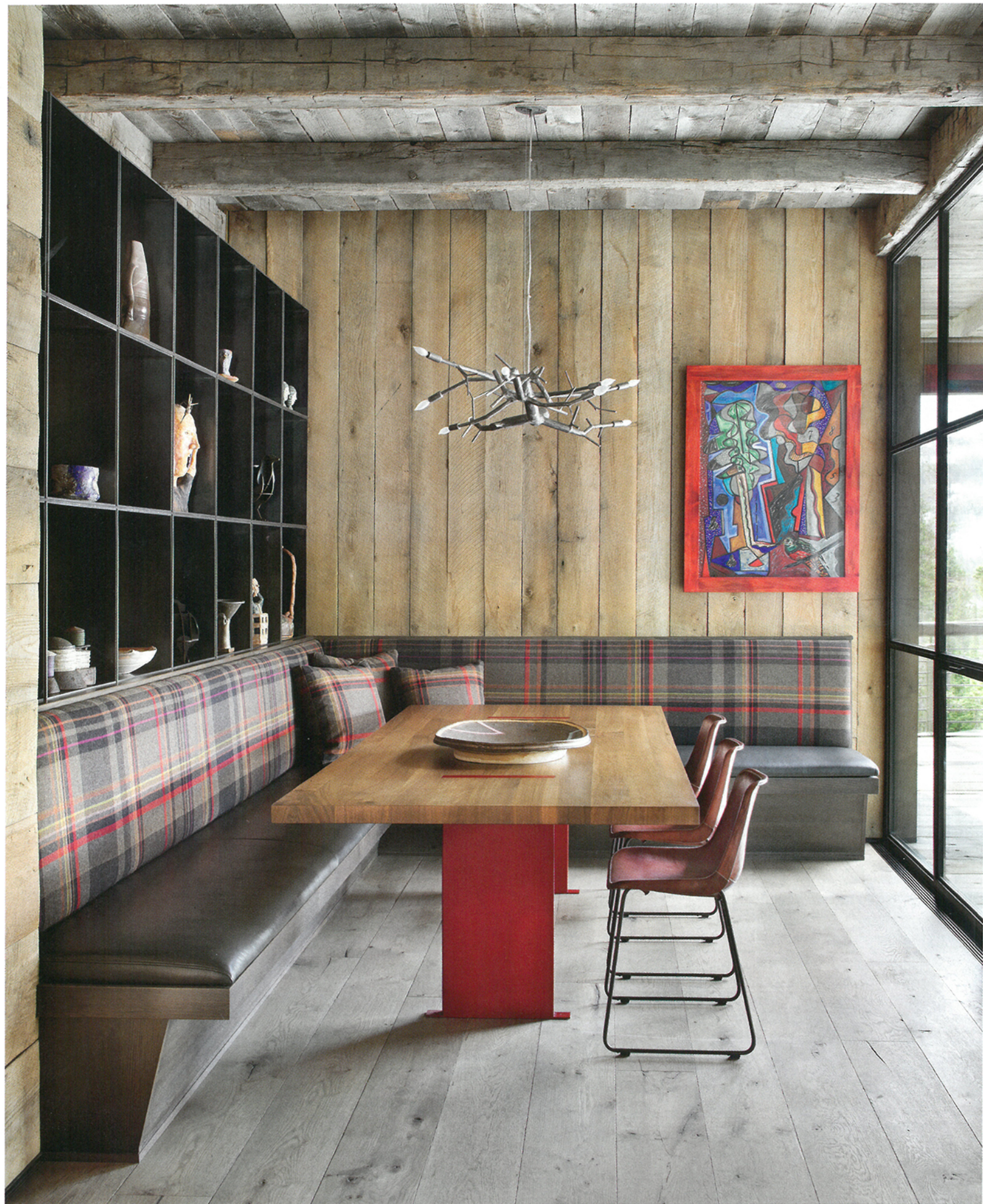
Opposite: Kanning paid tribute to traditional mountain decor in the kitchen's breakfast area, opting for a Maharam plaid for the banquette, a fixture by CP Lighting that resembles branches, and a wood table by Integrity Builders featuring a bright red base. The painting is by Italo Scanga.