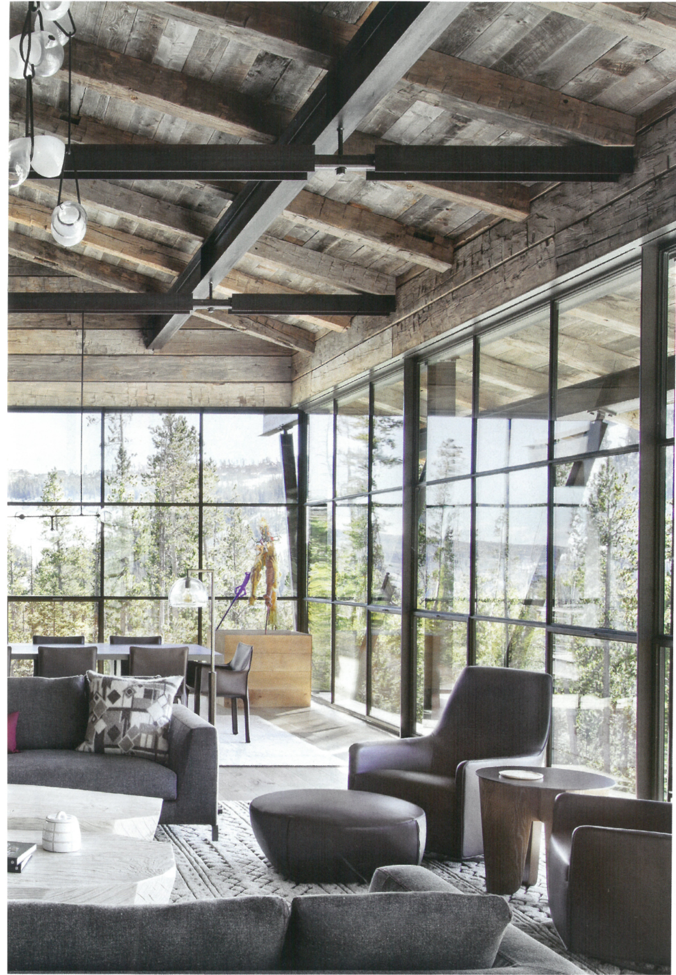
Assembled below a Lindsey Adelman chandelier in the living room are B&B Italia sofas, a pair of Minotti club chairs and Mimi London coffee tables. The rug is by Brunschwig & Fils. Montana Sash & Door supplied the windows.