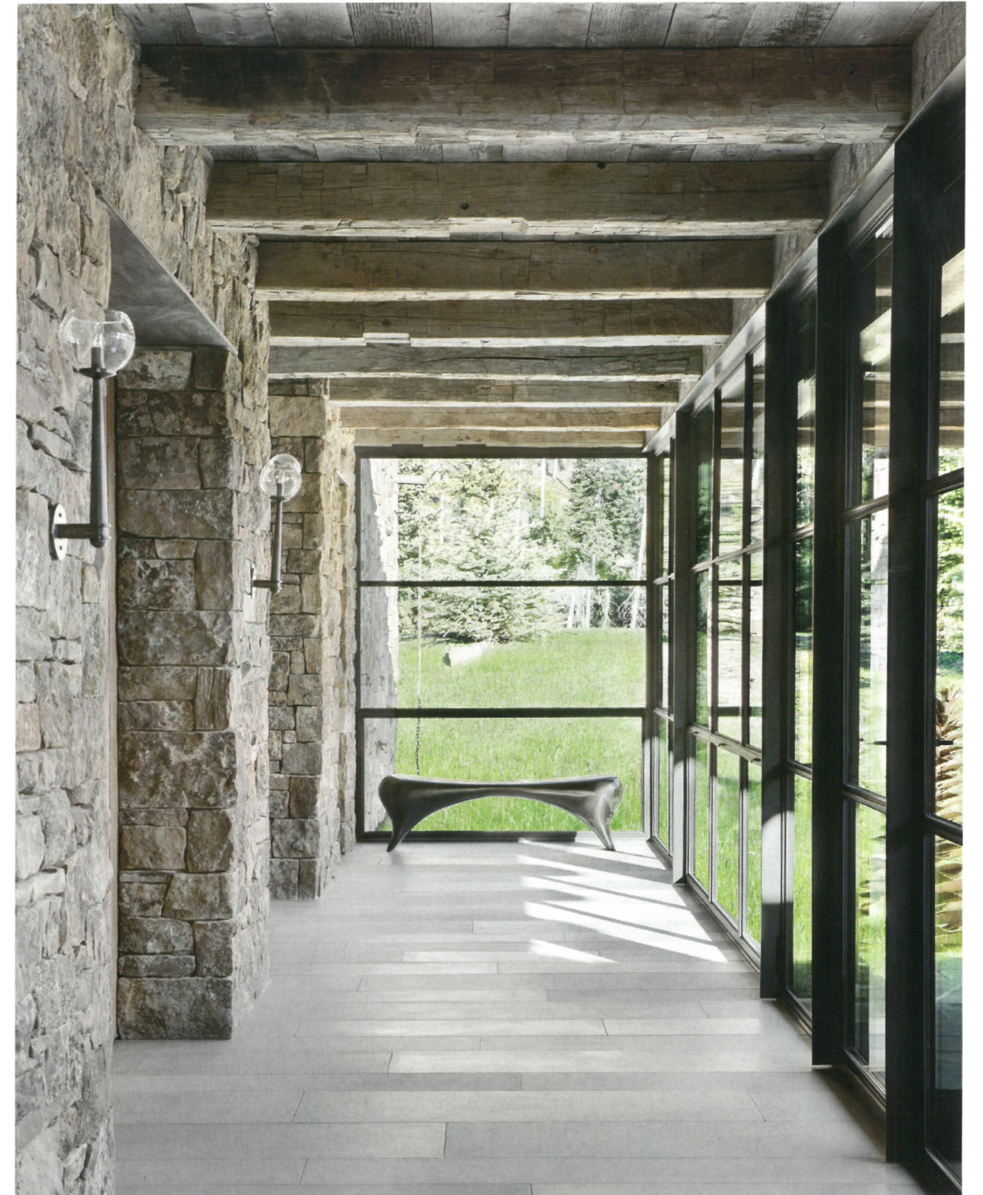
Below: Architect Larry Pearson's skillful marriage of old and new shines through in a hallway, where traditional stone and timber elements play off the contemporary metal windows framing views of the landscape conceived by Design Workshop. Matthew Fairbank Design sconces makes the space glow.