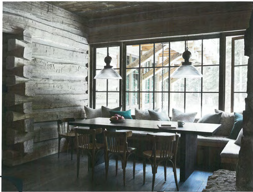
LEFT IN THE BREAKFAST NOOK, VINTAGE CHAIRS SURROUND A CUSTOM TABLE BY ARNOLD. BELOW A NATIVE TRAILS CONCRETE TUB WITH WATERWORKS FITTINGS ANCHORS THE MASTER BATH.