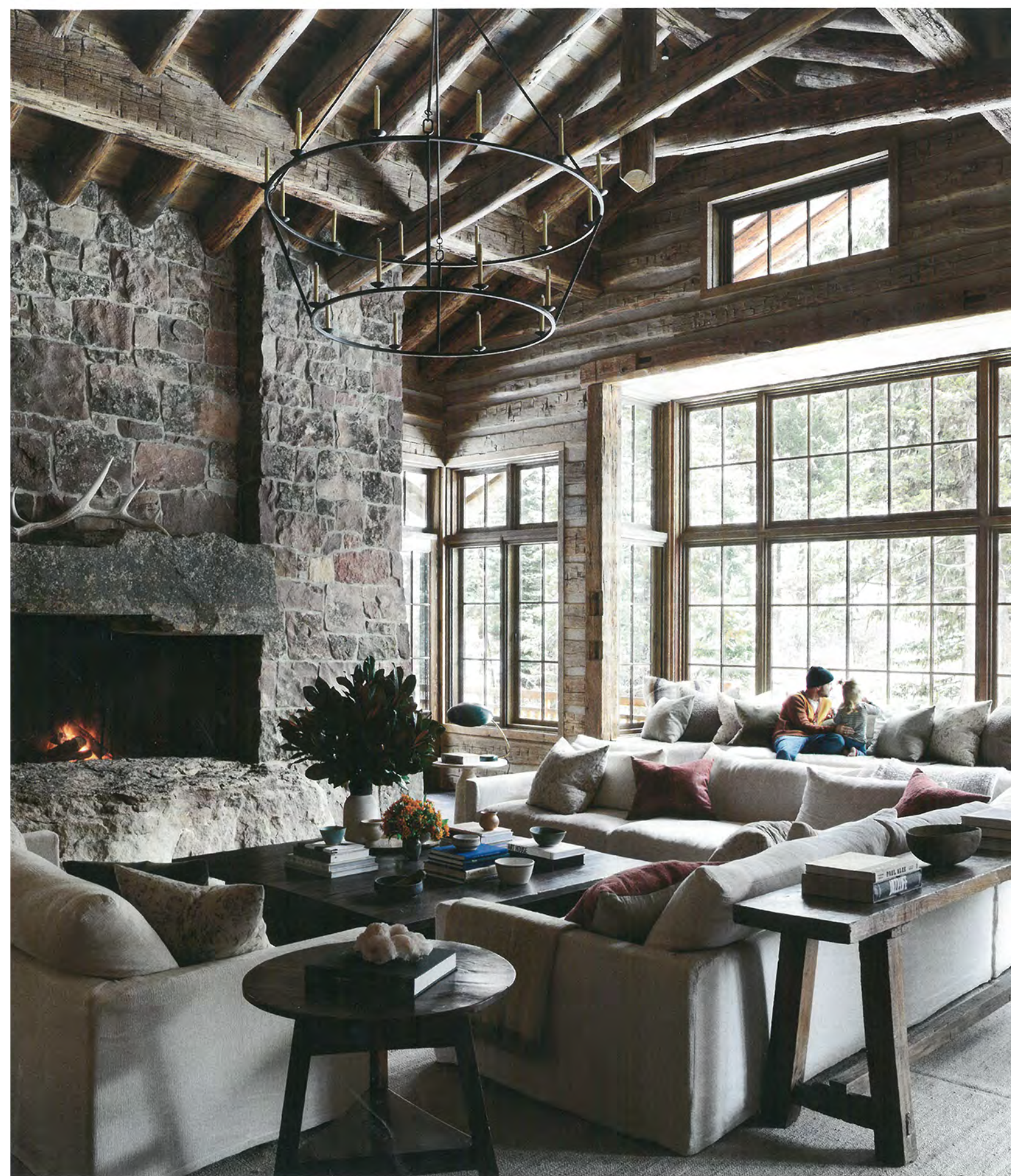
THE LIVING ROOM FEATURES A SIXPENNY SECTIONAL AND ARMCHAIRS. CUSTOM CHANDELIER BY ADG LIGHTING; ROUND SIDE TABLE (IN FOREGROUND) FROM OBSOLETE; PILLOWS OF RALPH LAUREN HOME AND HOLLAND & SHERRY FABRICS.

★ EXCLUSIVE VIDEO AARON PAUL AT HOME, ARCHDIGEST.COM.