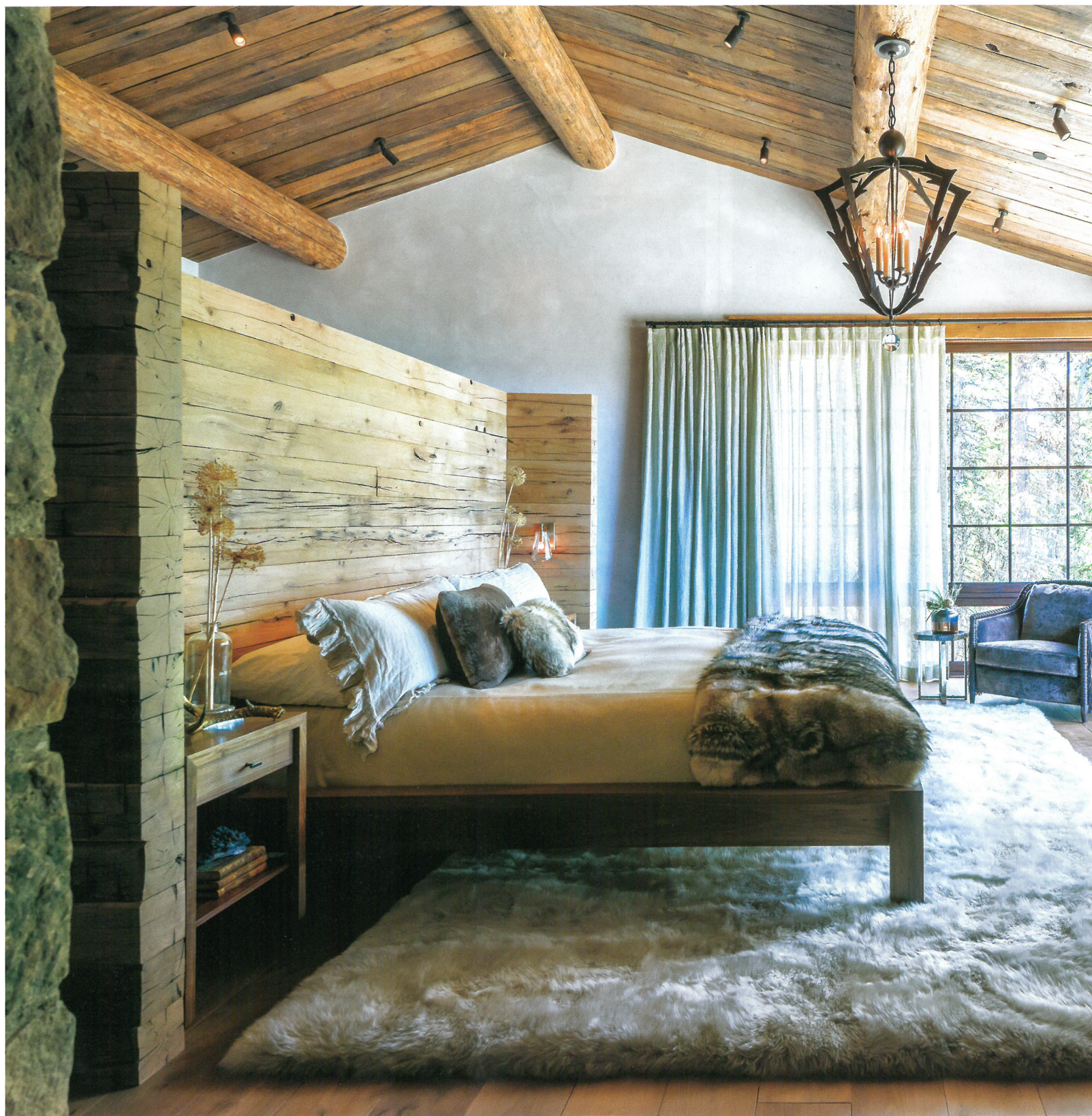
BELOW: A custom-designed bed set against a timbered half wall is positioned to enjoy the views through two walls of floor-to-ceiling windows. The chandelier is from John Brooks, Inc.; the bed and nightstands were commissioned through Tim Sanford. OPPOSITE, TOP: The sculptural carved marble tub makes a dramatic statement in a master bath with custom floating vanities and low-profile mirrors. OPPOSITE, BOTTOM: Guest-room bed designed by Rain Houser and Skye Anderson; the graphic shapes on the textural rug speak to the mod angular chandelier.