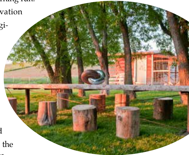
Gatherings under an umbrella of trees and a view of the barn beg for parties en plein air. The dining table and “chairs” made of tree stumps add to the charm of this outdoor room. Sculpture by Gary Bates.

During the renovation conservation and ecological concerns were two of our top priorities. “The ultimate in recycling is the redevelopment of an existing home,” says Pearson. Concrete floors with radiant heat throughout the house, and passive solar energy keep the home cozy in winter. When asked about air conditioning, Pearson replied, “ We don’t need it. The doors and windows were thoughtfully placed to allow for as much cross ventilation as possible.” Montana summers can be hot, so Pearson built a berm, thus insulating the lower level where the bedrooms are located from summer’s heat.